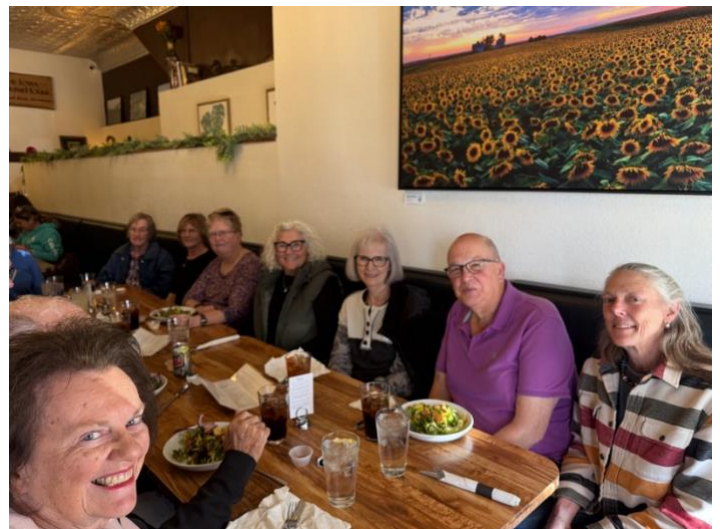
Grundy County 55er's assembled a group to visit Shell Rock, too! A delightful time was had by all!