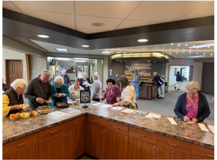
Attendance for Second Sunday Socials is growing! Join us for one last gathering on May 10 before the summer break.