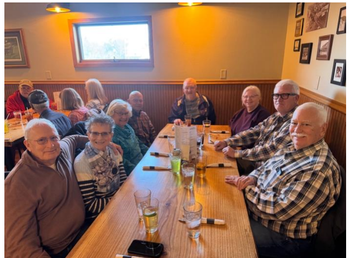
Cedar Falls Route 55er's enjoy dinner at the Iowa Prime House before attending the Shell Rock Swing show!