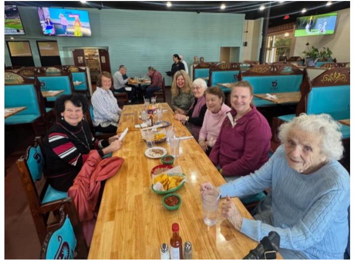
April's monthly lunch took place at La Isla. Ole!